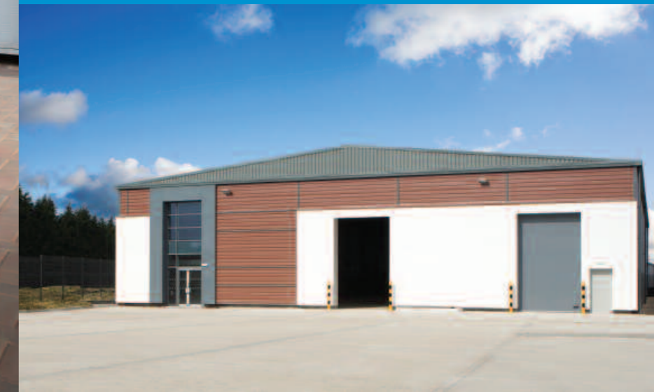
NEWLY BUILT WAREHOUSE/INDUSTRIAL UNITS RANGING FROM 3,000 SQ.FT - 15,000 SQ.FT